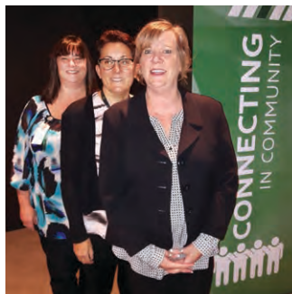
Partners Strathcona Library and Family and Community Services Strathcona County and PEP Together we ARE Stronger!